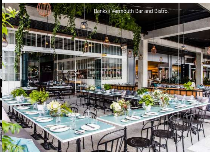
Banksii Vermouth Bar and Bistro.

Part of Sydney's new Barangaroo precinct on the western harbour, Banksii has a fast line in vermouth, cocktails and a delicious menu. The space is glass-encased, with a large, bookable waterfront terrace, and can be arranged to accommodate everything from an intimate meal (up to 40 in the semi-private area) to dining for 120 (exclusive use of the restaurant), to a cocktail party across the whole venue for up to 200. Hack: the new ferry terminal at the restaurant's doorstep means a ceremony on the water is on the cards. 33 Barangaroo Avenue, Barangaroo, banksii.sydney.