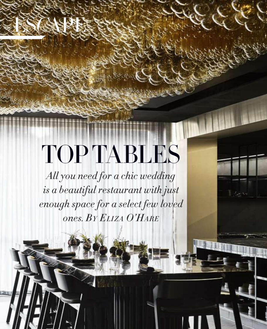
Doot Doot Doot at Jackalope hotel.

All you need for a chic wedding is a beautiful restaurant with just enough space for a select few loved ones. BY ELIZA O'HARE