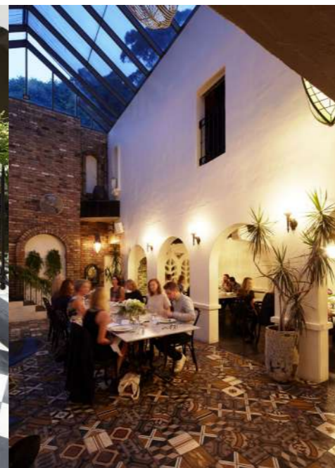
Porteño (and right).